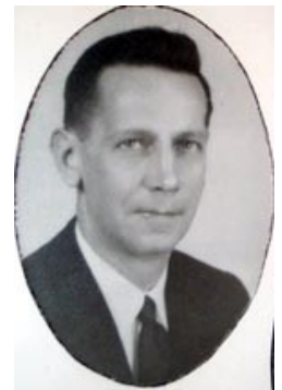
Western Electric Engineer